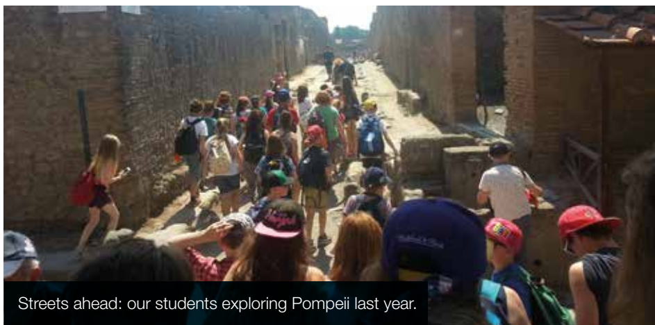
Streets ahead: our students exploring Pompeii last year.

ALERT! We will soon be opening our own little shop at school to sell essentials such as gum shields. Please support us!