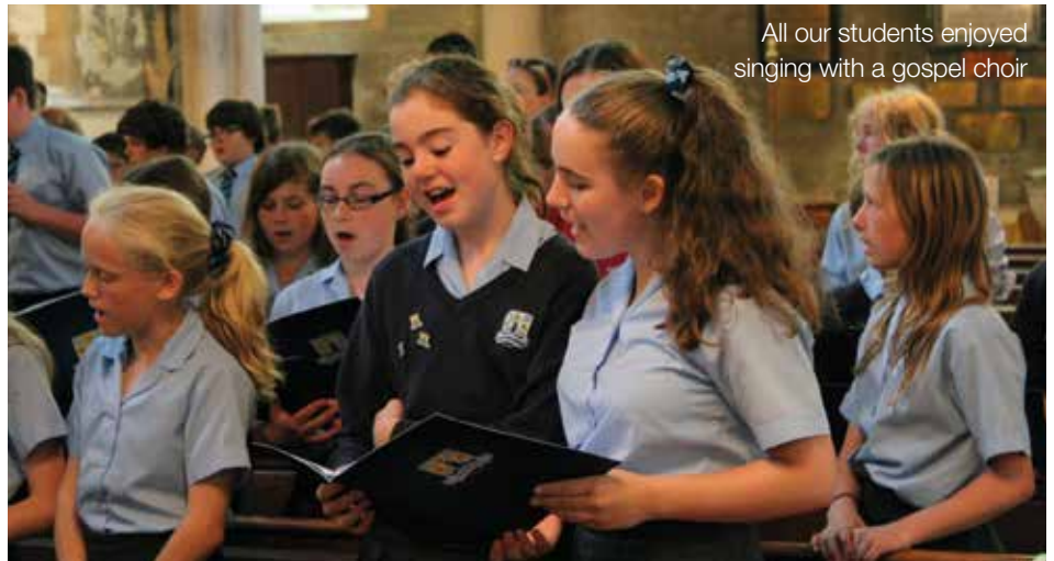
All our students enjoyed singing with a gospel choir

Students met their mentors and experienced a range of lessons with activities including writing Latin postcards, making pop-up volcano cards, and dressing up as superheroes in Drama. They also tried playing a range of musical instruments (everyone plays an instrument at our school). In the evening, parents came in to